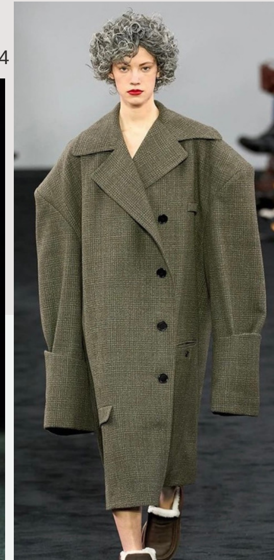
(15) JW Anderson AW 2024

The Maxi Tailored Coat, an evolved form of overcoat, is a big trend in the 2024 outer style.