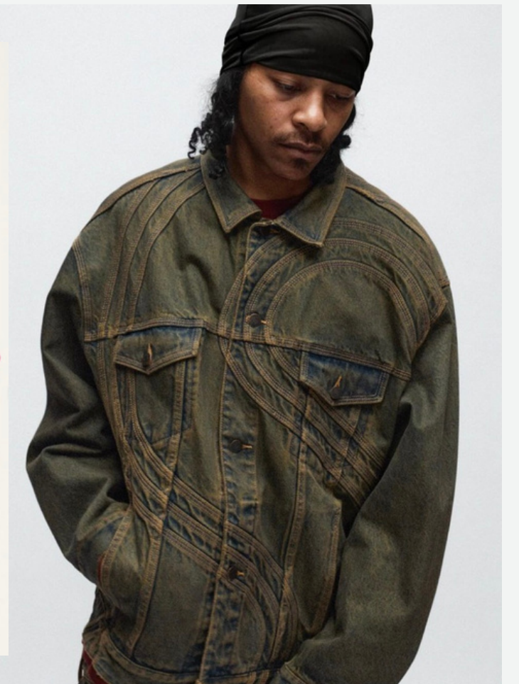
(11) Supreme SS 2024 Collection