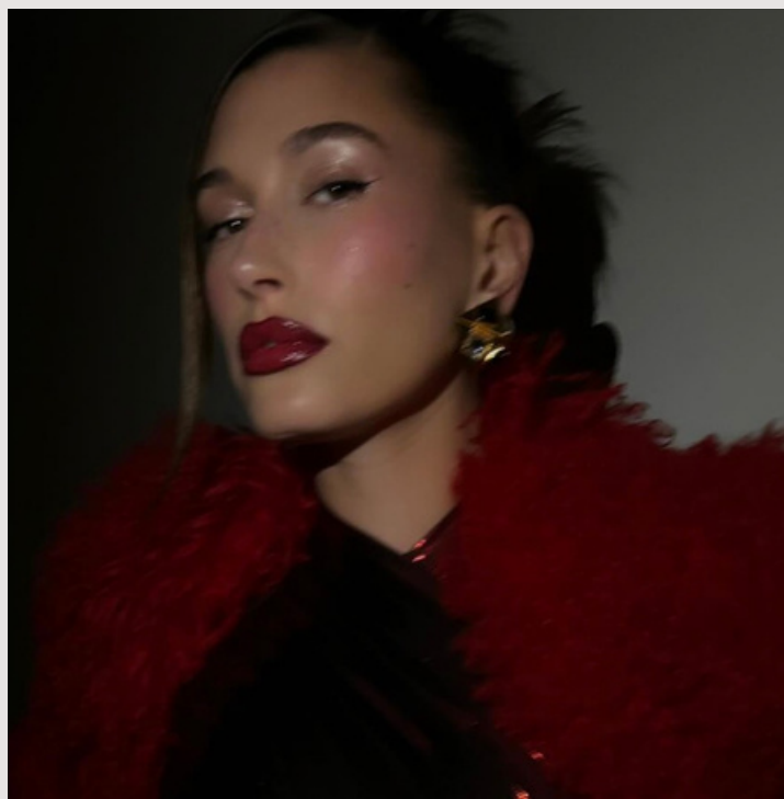
(9) haileybiber instagram, Post, Dec 13, 2023

: Elegant skin, Bold brows, Luscious lips with red or brown color, and, definitely, French manicure