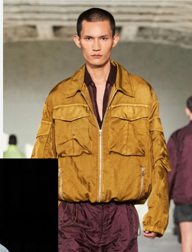
(19) Dries Van Noten SS 2024 Collection