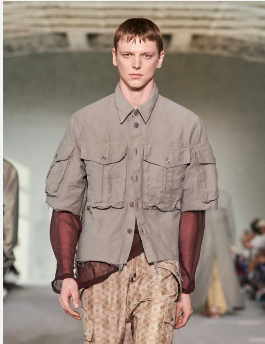
(19) Dries Van Noten SS 2024 Collection

Moreover, in line with last year's utility details trend, shackets with expanded utilitarian detailing are still popular among consumers, especially young tastemakers. The key considerations of the trend are oversize, multiple pockets, hypertexture, and technical finishes.