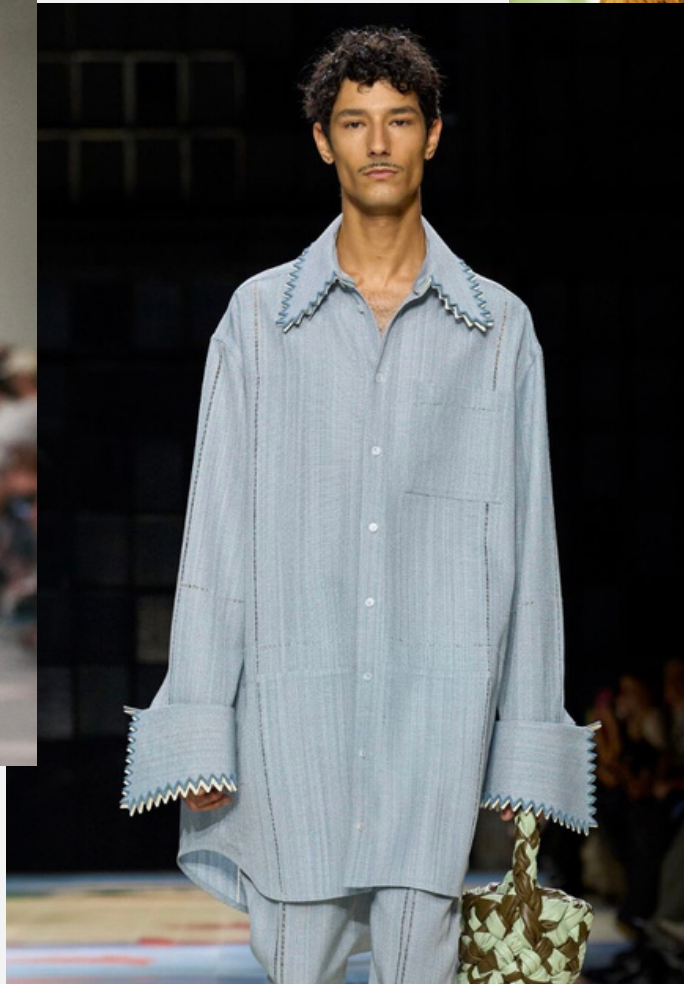
(20) Bottega Veneta Summer 2024 Collection