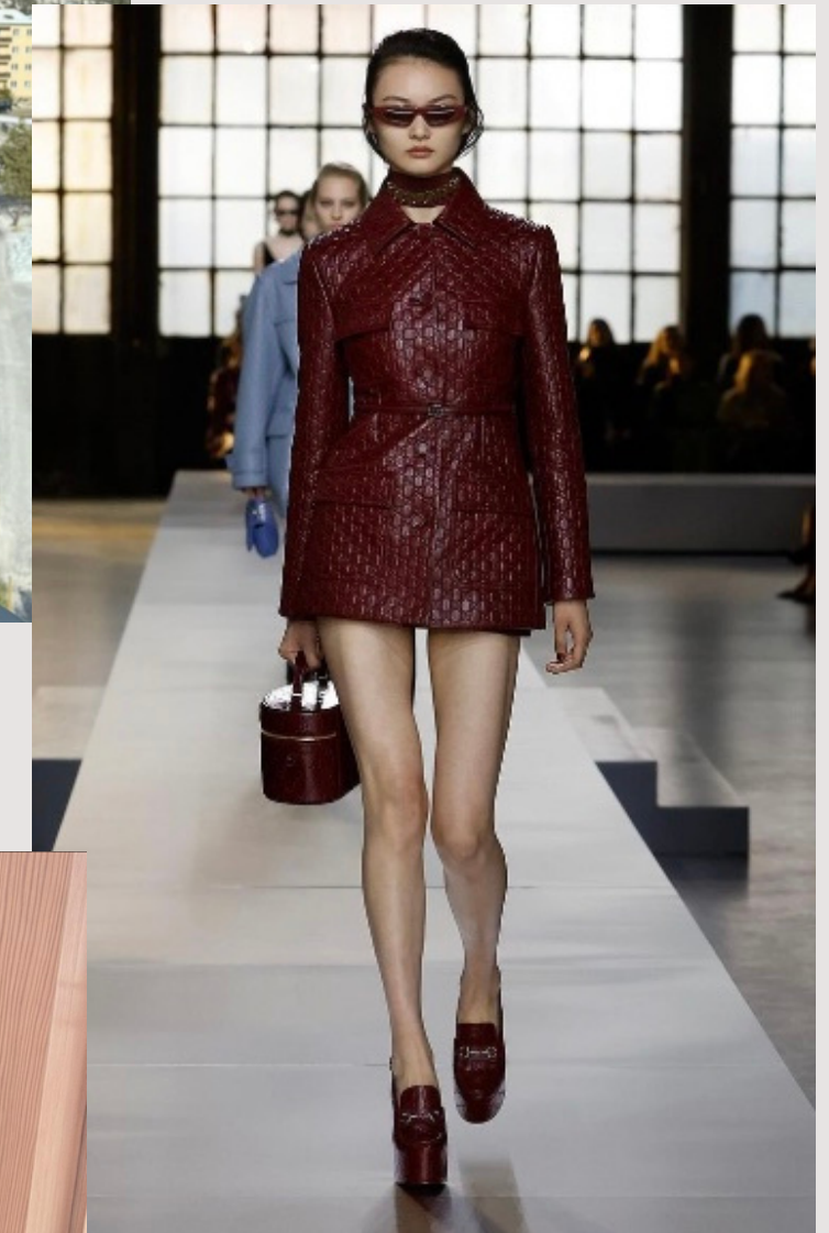
(24) Gucci FW 2024