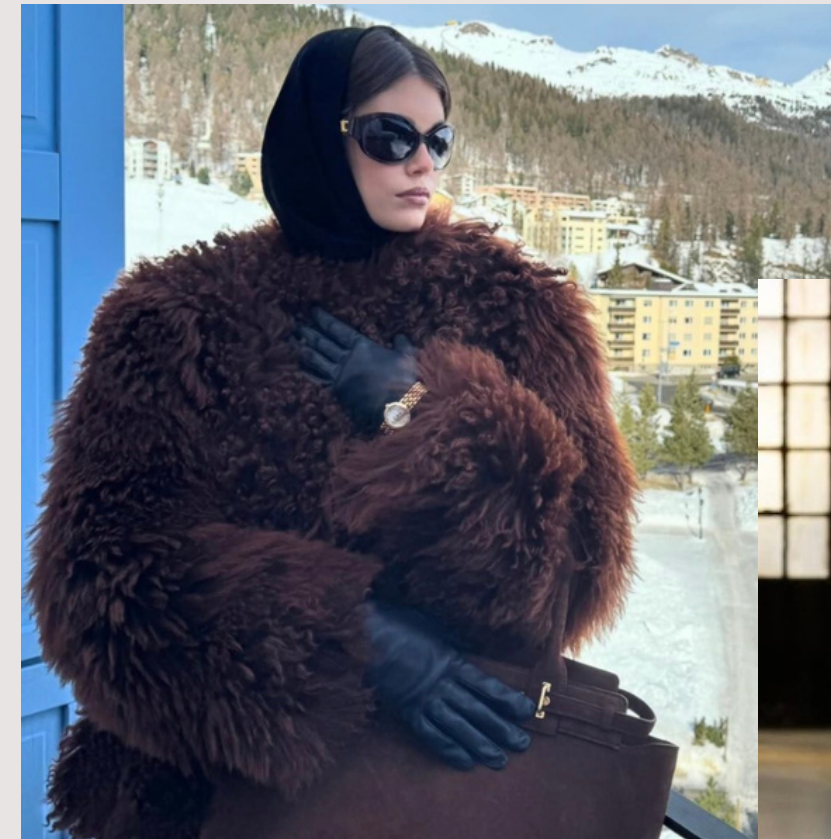
(10) kaiagerber instagram, Post, Feb 08, 2024

Thinking of the ‘more is better’ approach, the key elements of the mob wife fashion are fur coats, bold jewelry, sunglasses, logo-heavy handbags, and lots of animal print.