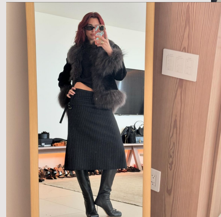
(8) dualipa instagram, Post, Feb 03, 2024