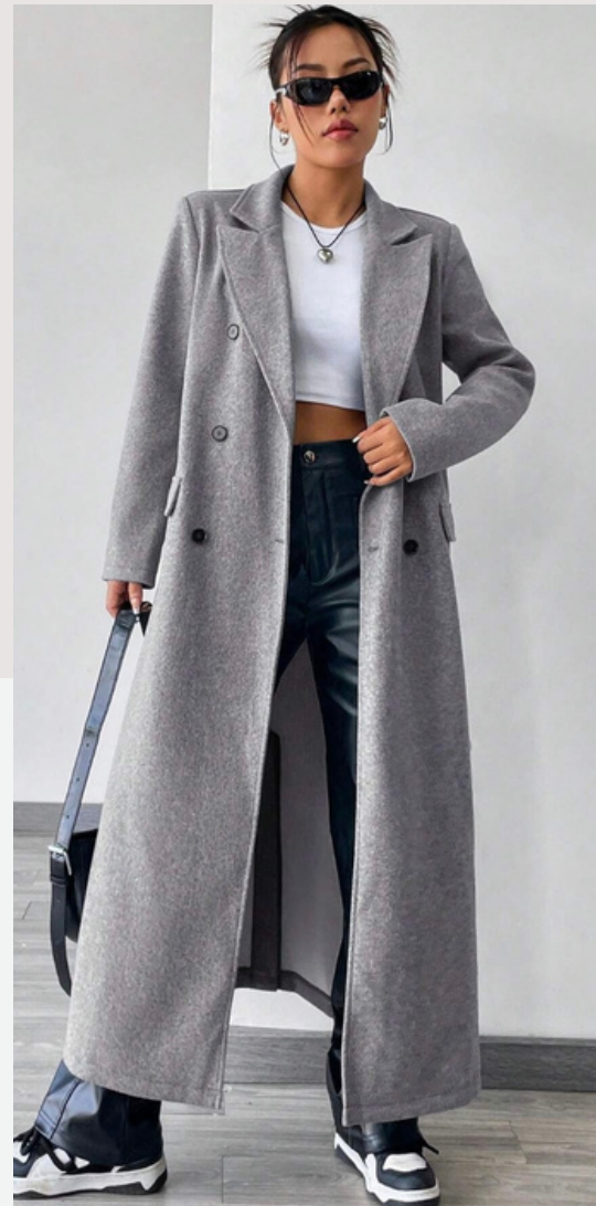
(23) Shein Collection