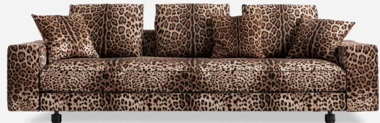
(1) Dolce&Gabbana Collection 2024