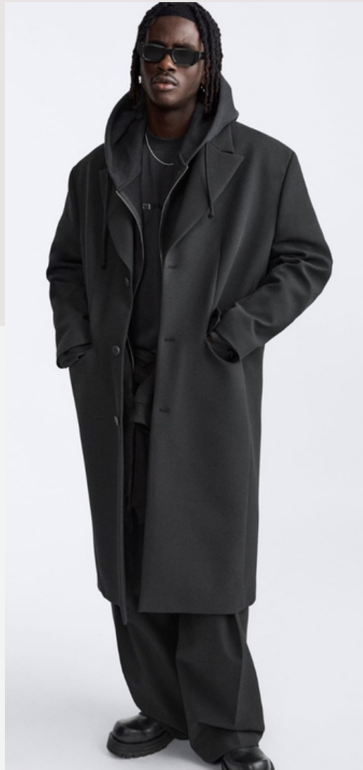
(18) Zara Collection