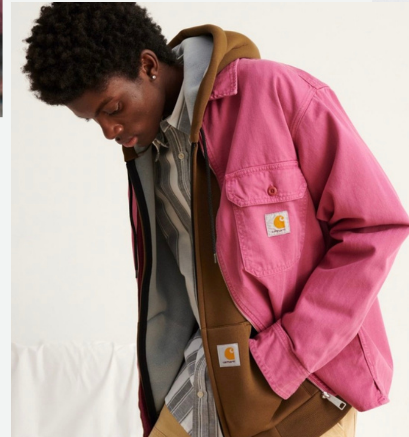
(7) Carhartt SS 2024 Collection